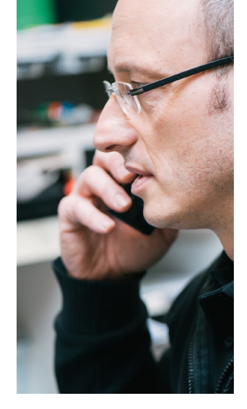
24/7 Lenze expert helpline