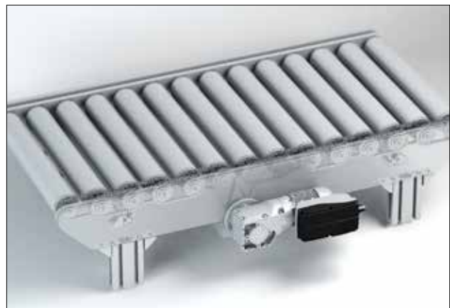
Example: Roller Conveyor Outline